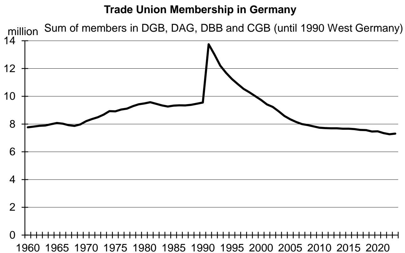
Figure 1: Trade union membership in Germany